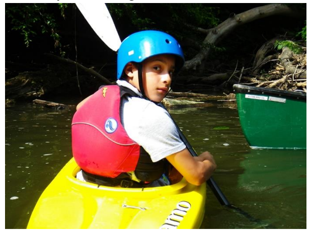
You're going to ask me to do what?