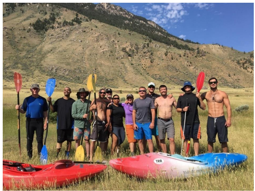
Montana Outtasight Clinic for blind veterans

TRR enjoys being part of the paddling community and has interest in stewardship, conservation, and access to our rivers and waterways.