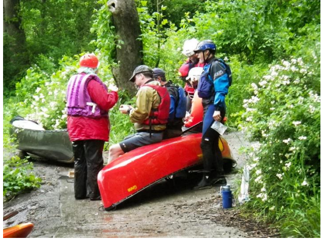
Lunch at Blue Hole