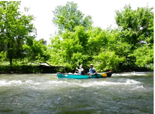
Tom (bow) & Liam (stern) over the ledges