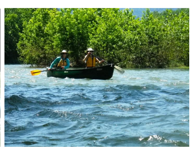
The Quam tandem team