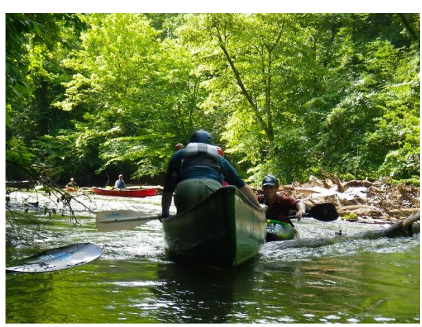
Close encounters of the log kind