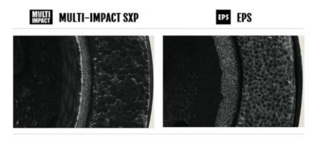
An example of multiple foam layers from ProTec helmets

Many custom helmet manufacturers like MadHat, Grateful Heads, etc. use this as their liner.