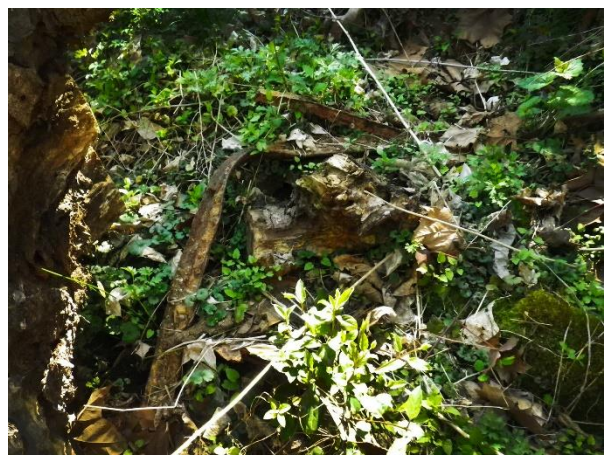
Metal to be uncovered and pulled out