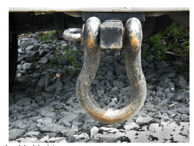
Now that's a shackle hitch!