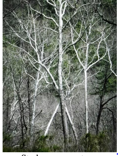
Stark sycamore trees