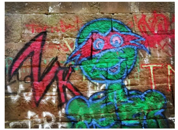
Watchful eyes overseeing the work