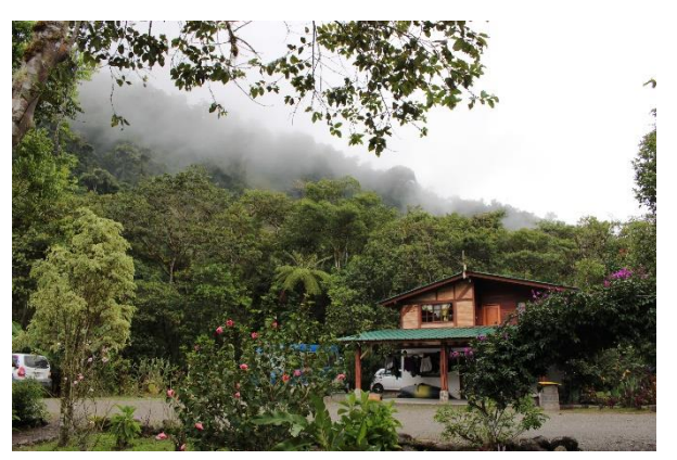
The Rio Qujios Eco-lodge

Thereafter, we hopped on the bus with Angel, a 20-year ERA driver and land guide extraordinaire. We headed out-of-town, over a 14,000 foot pass, into what is called the "Oriente" of Ecuador. We reached our home away from home for the following three days, the Rio Quijos Eco-Lodge on the banks of the Quijos River. It was a huge contrast to the big city of Quito. For those who don't get enough exercise paddling, there is a yoga stand on the Quijos as well as miles of hiking/running trails through the jungle around the lodge!