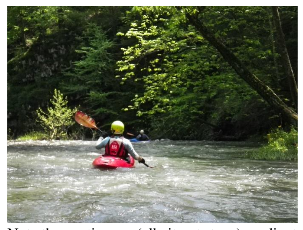
Note the continuous (albeit not steep) gradient