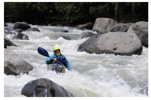
Lower part of Pica Piedra