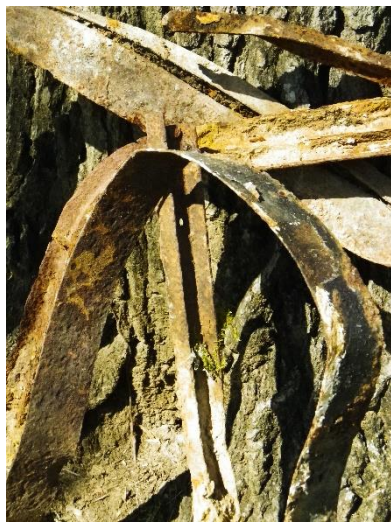
Mill metal assembled