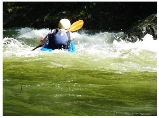
Barb surfing below one of the ledges