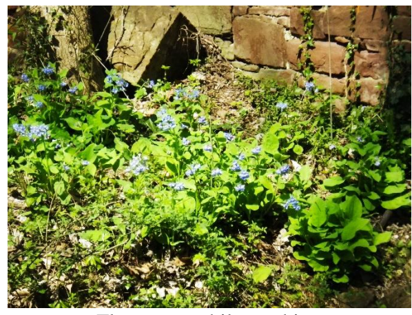
Flora seen while working