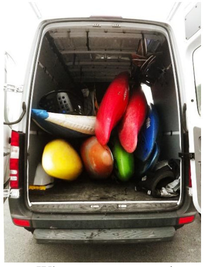
Why you want to wait for this shuttle vehicle at every turn on the route