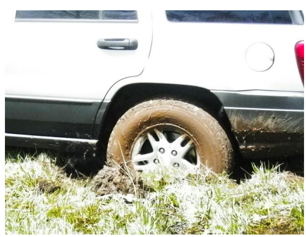
Just had the vehicle detailed the day before ☺

One is able to park in a field along the river for a small fee ($3/boat). This is three to four miles downstream from Capon Bridge (US 50) on CR 15. It cuts off some relatively flat water. Sounds good! The last shuttle driver to peel out, however , did not pay attention to the sweet flag growing in his planned exit route. Sweet flag grows in moist areas. Four-wheel drive may not mean much when you are up to your hubcaps in mud. Fortunately, West Virginia locals came to the rescue. (See Postscript.) We were on our way..... The run was a personal first descent for multiple paddlers!