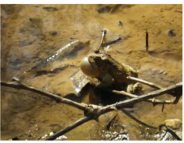
A croaker next to the metal bars