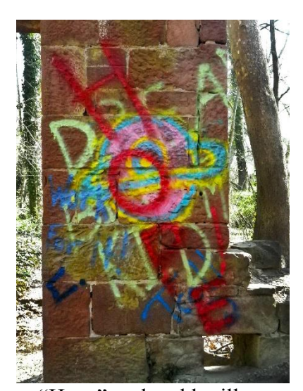
"Hope" at the old mill