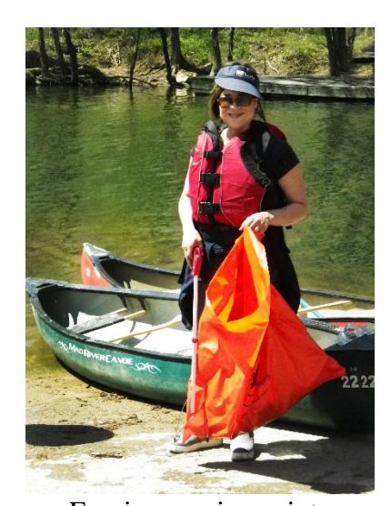
Earning service points