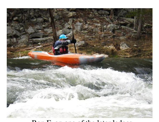
Ron F. on one of the later ledges