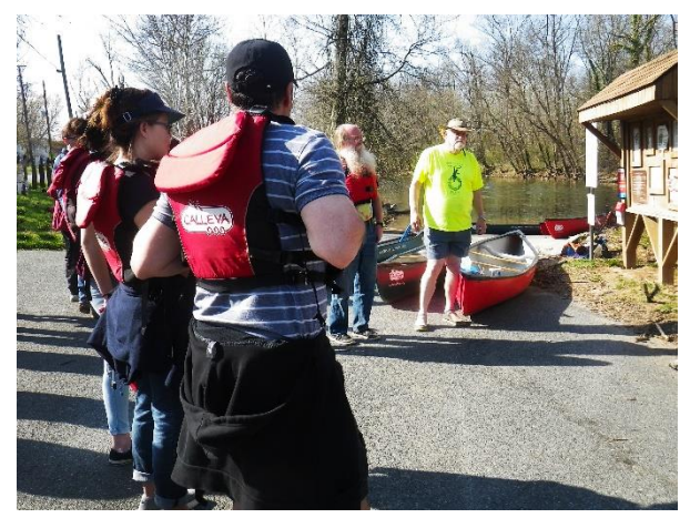
Getting ready at Seneca Creek take-out