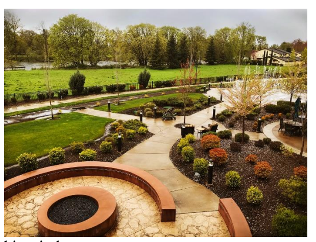
Views outside his windows