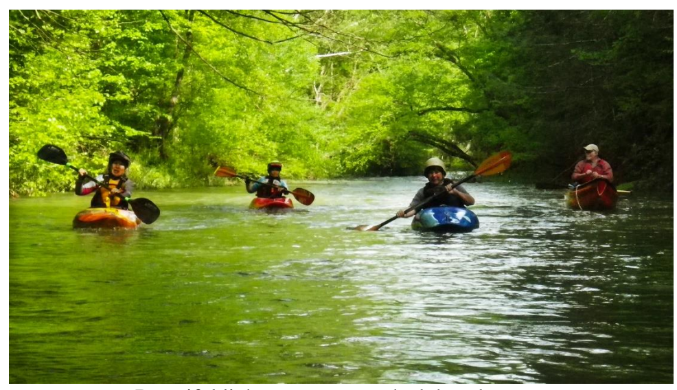
Beautiful light as we approached the take-out