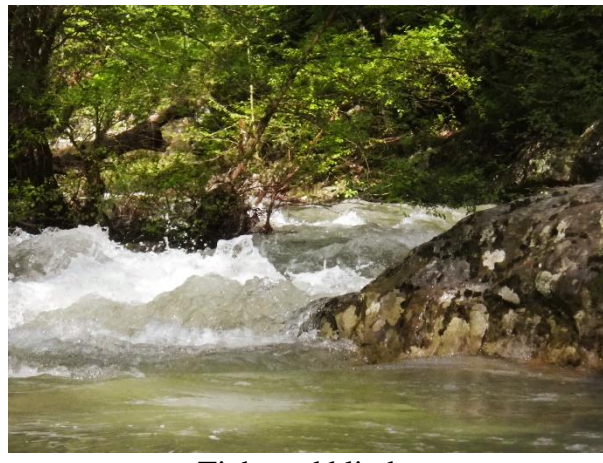
Tight and blind