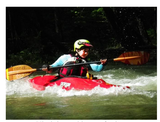
Virginia working on ferries