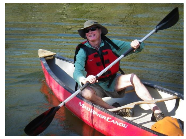
Plenty of room for garbage on departure