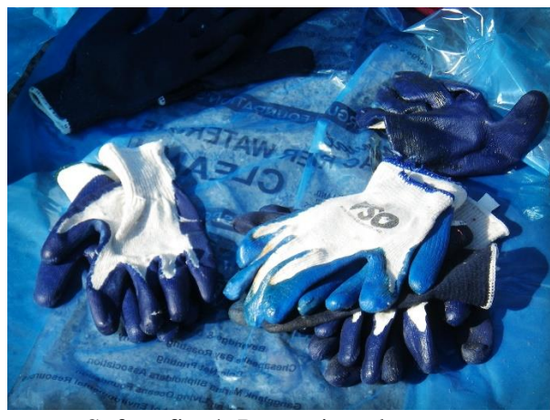
Safety first! Protective gloves