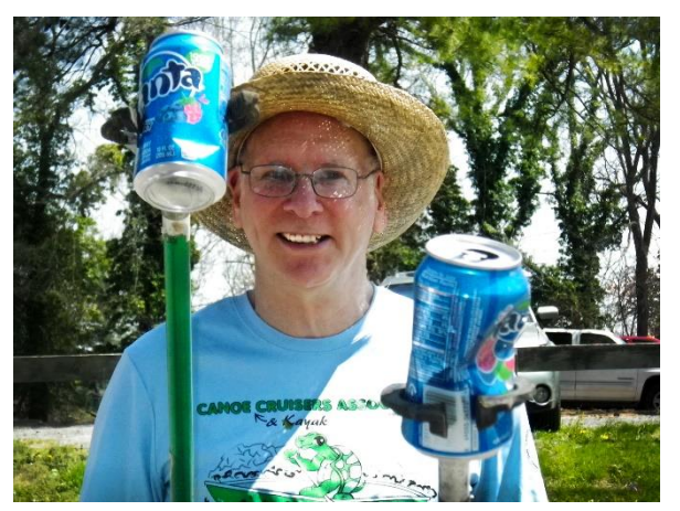
Trash grabbers at work