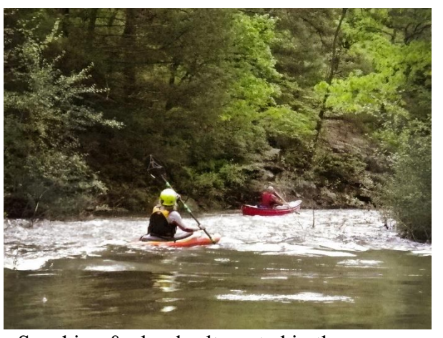
Sunshine & clouds alternated in the canyon