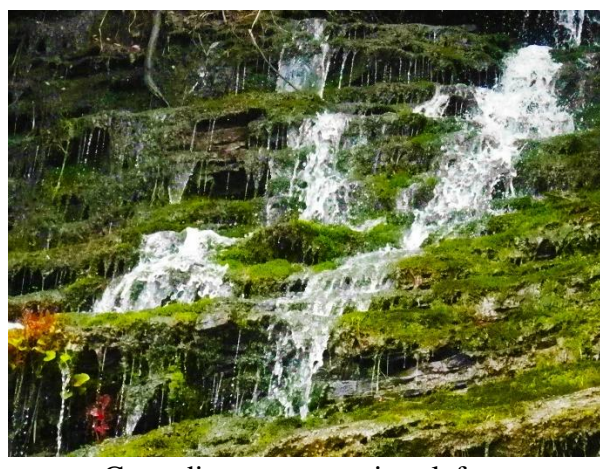
Cascading water on river left