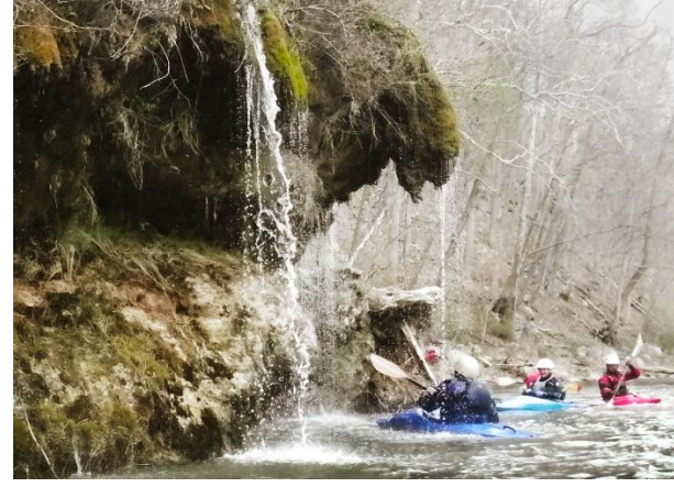
Checking out the weeping rock. The dripping water was quite cold. Note the absence of downstream understory vegetation & water cascades along the valley walls. Very different one month later.