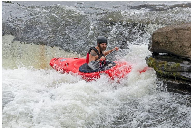
More difficult than it looks