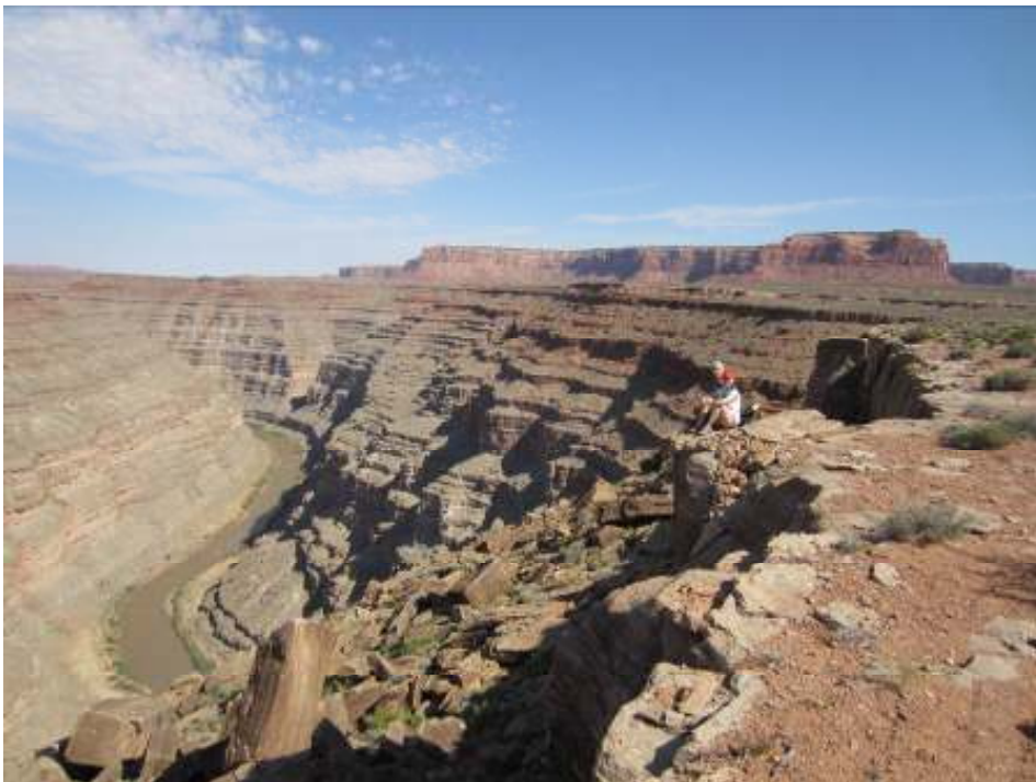
Dad and I sitting at the top of the Honaker Trail.

The next day, May 29 th , we paddled fourteen miles to Lower John's Canyon. Lower John's was by far my favorite campsite of the trip. Wild primroses covered the camp and we were visited by occasional hummingbirds. We found a