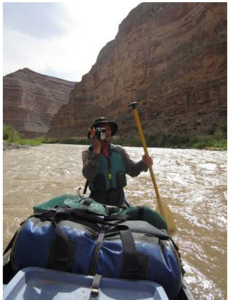
Dad attempts to talk, video, and steer the boat at the same time!