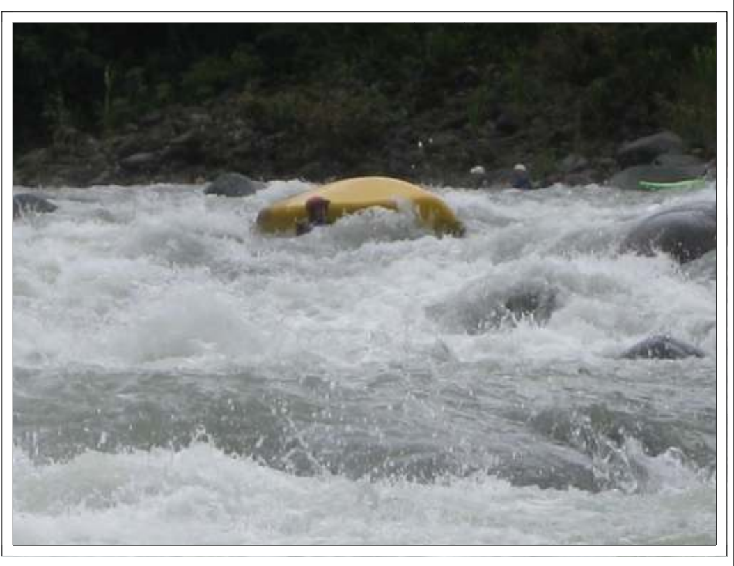
CARNAGE PREVIEW: Larry swims on Class 4+ Lower Pacuare rapid

All week one of the guides took videos at all the top rapids. She put this together as a broadcastquality promotional highlights video. Larry and I purchased a copy, and will be showing it at the May 10 BRV meeting. You will see our whole gang, mostly making successful runs down various squirrelly rapids. There is a carnage section of the film; if you want to see the blood and gore, you'll have to come to the meeting!