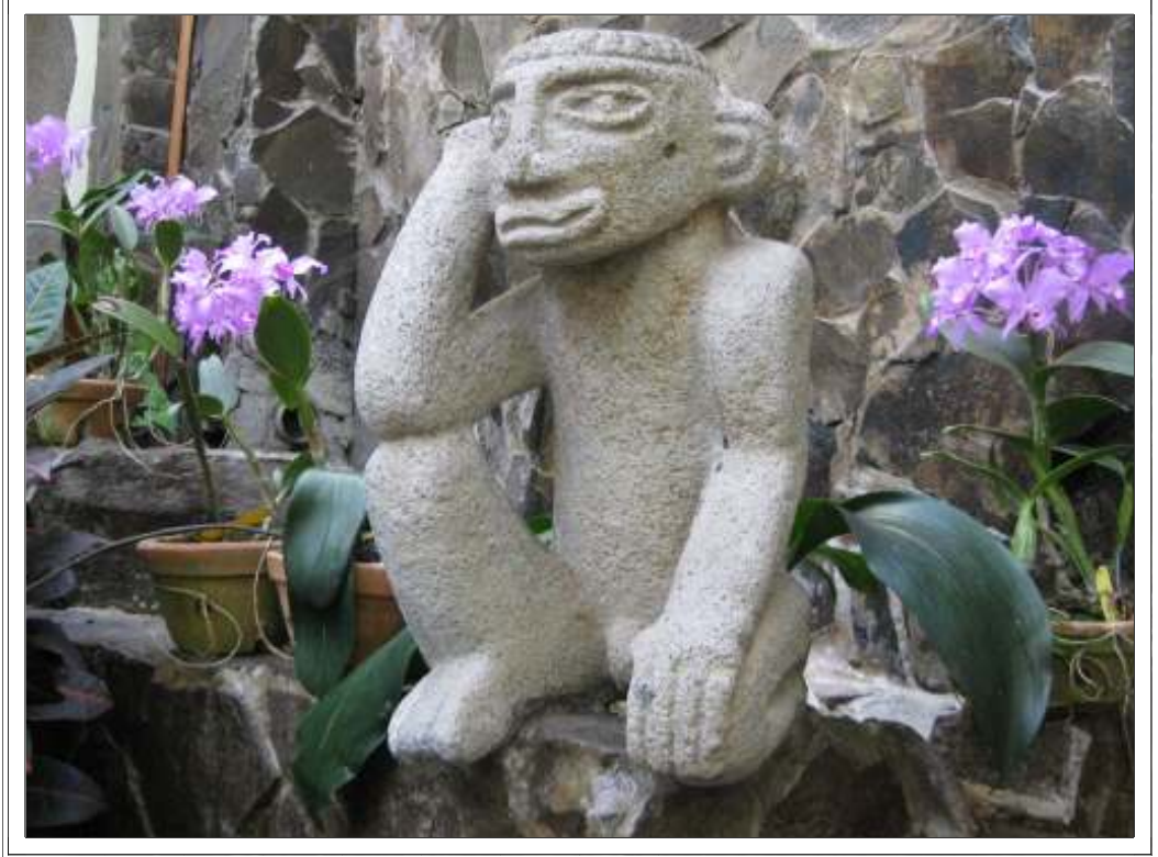
Native art at the Hotel Don Carlos, San Jose

too many, but there are interesting things to see there. spring paddling here. The historic Hotel Don Carlos is one of the best and most interesting hotels anywhere, and quite reason-